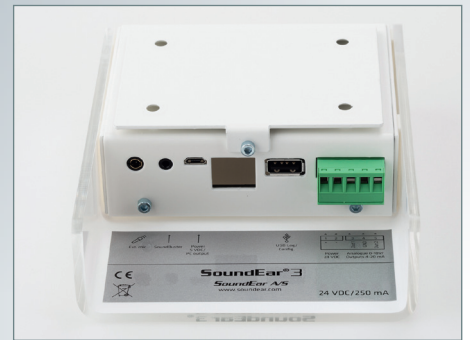
SoundEar®3 – grav