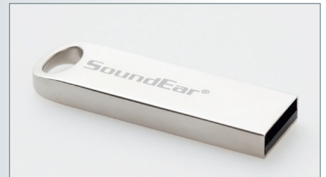
USB nøgle til aflæsning af data