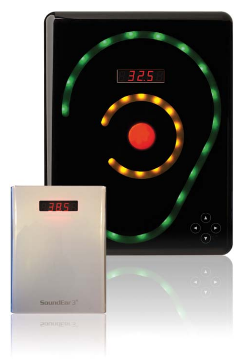
SoundEar®3 is available in two versions.

Not only does a good auditive environment facilitate recovery, it also leads to better sleep patterns and higher levels of patient and staff well being.