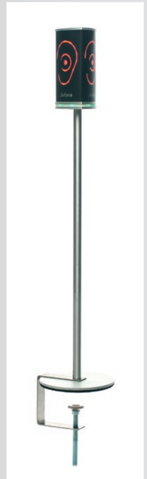
The Jabra Noise Guide comes with different attachment interfaces, to fit different office setups.